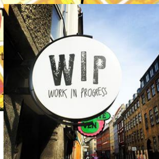
Restaurant WIP Sankt Peders Stræde 34