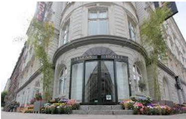
Hotel Ibsen Vendersgade 23