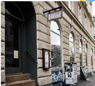
Restaurant HÖST Nørre Farimagsgade 41