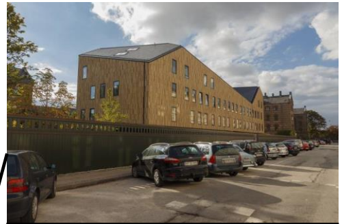
UCPH, Department of Economics, Building 35, near Gammeltoftsgade 17